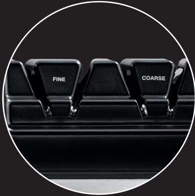
Fine and coarse grinding wheels