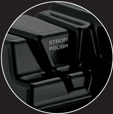
Stropping wheel for more efficiency